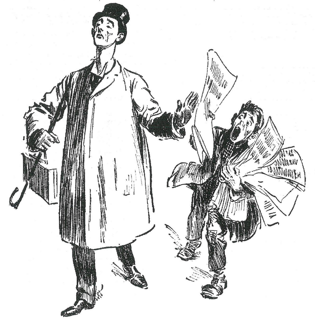
Major vendors of CAPM betas such as Merrill Lynch, Value Line, and Bloomberg distribute Blume adjusted betas to investors.