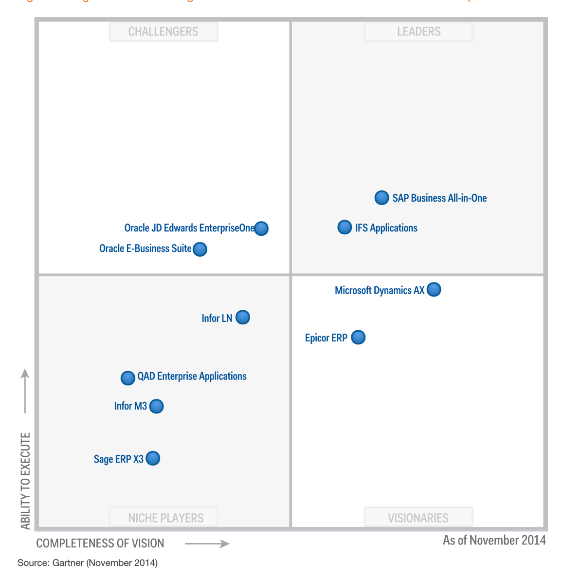
Figure 1. Magic Quadrant for Single-Instance ERP for Product-Centric Midmarket Companies