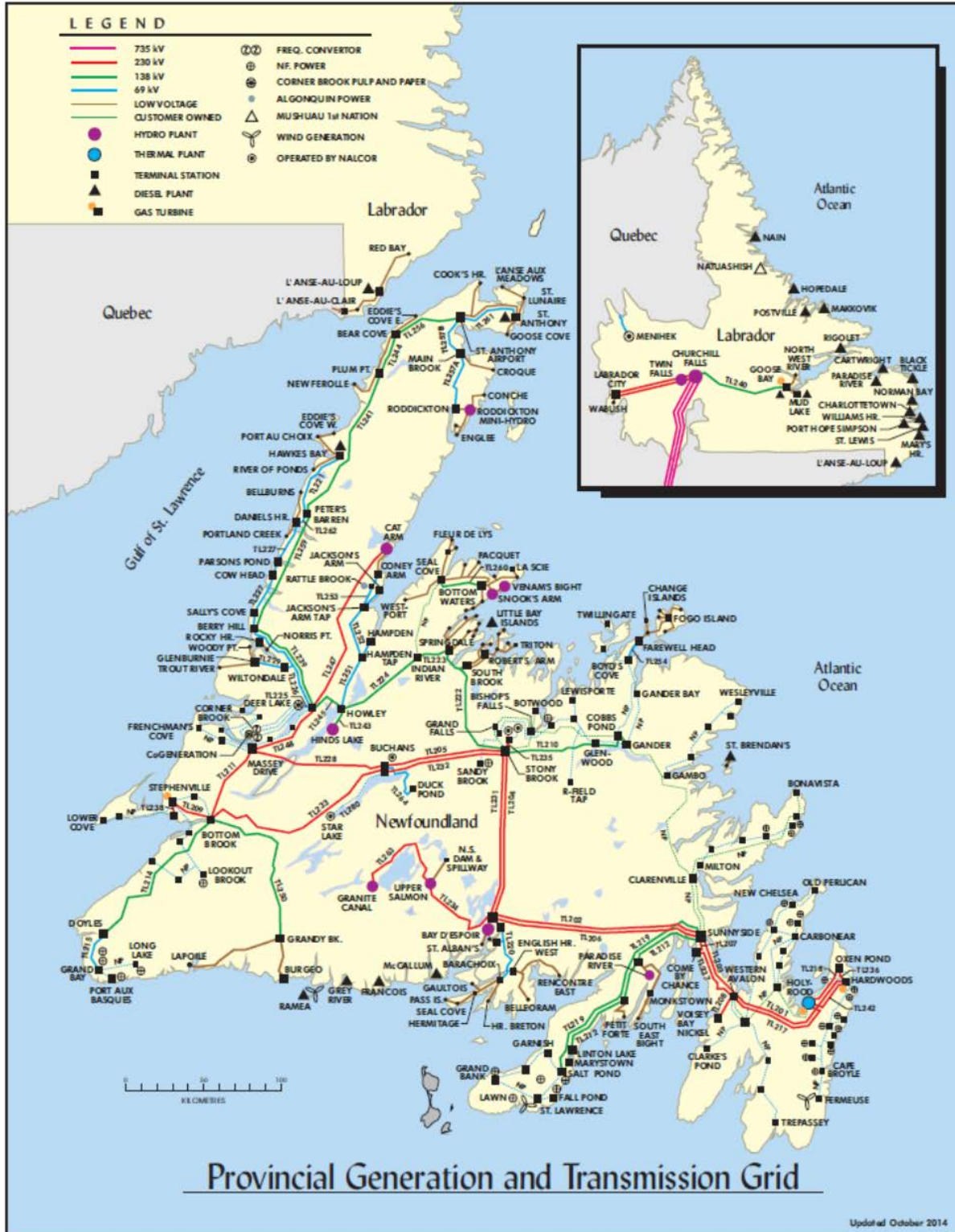
Figure 1 - Hydro's Generation and Transmission Infrastructure