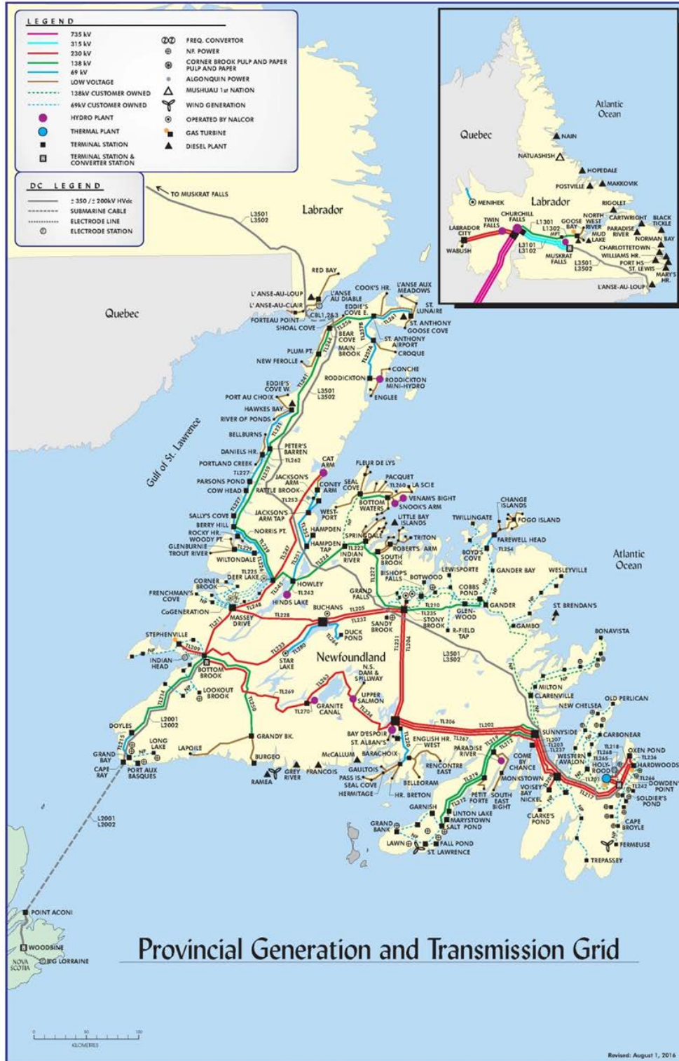
Figure 2 - Hydro's Generation and Transmission Infrastructure Post Interconnection