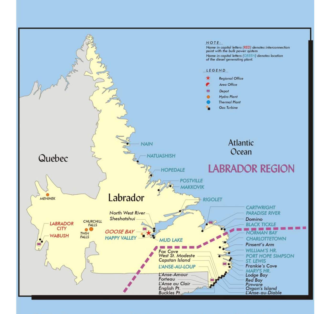
T.R.O. Communities Served by Interconnected Systems & Diesel Systems